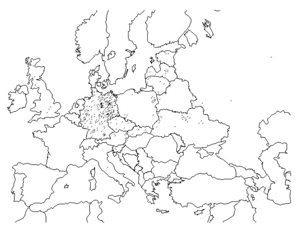
Fig. 1. Location of study plots for the Monitoring of Raptors and Owls in Europe.